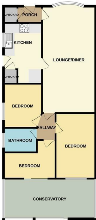
GROUND FLOOR 991 sq.ft. (92.0 sq.m.) approx.